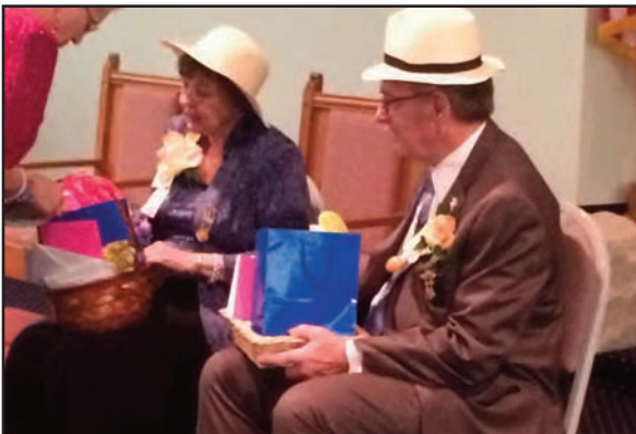
Left: WGM and WGP dressed for their Garden Birthday Party