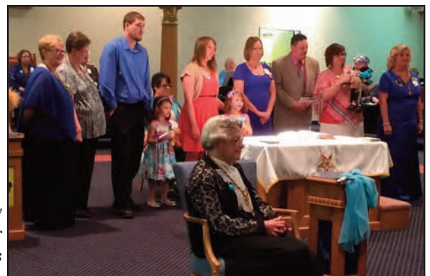
Right: Baby Dedication for three little ones