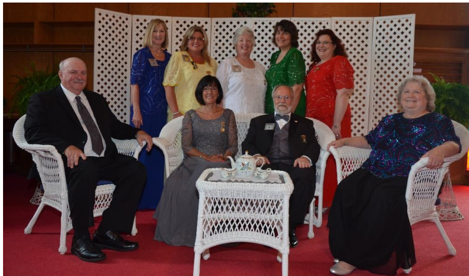
WGM & WGP and spouses with the Grand Star Points