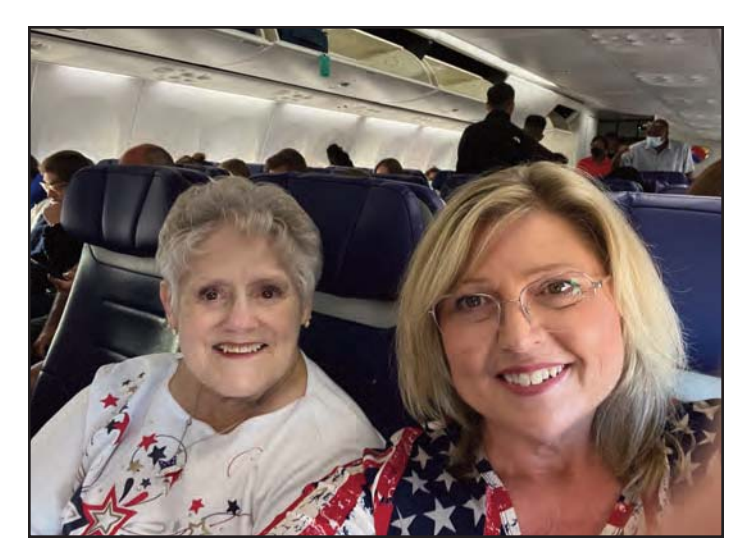
On the way to South Carolina