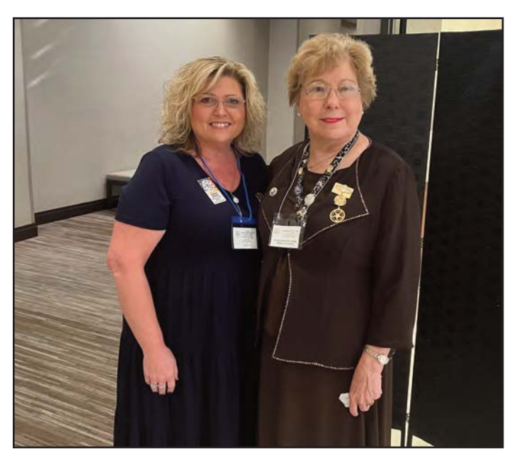
WGM & MWGM

Thank you! We couldn't continue without your support of the printed issues of Star-Lite Magazine.