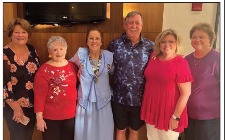
South Carolina WGM & WGP