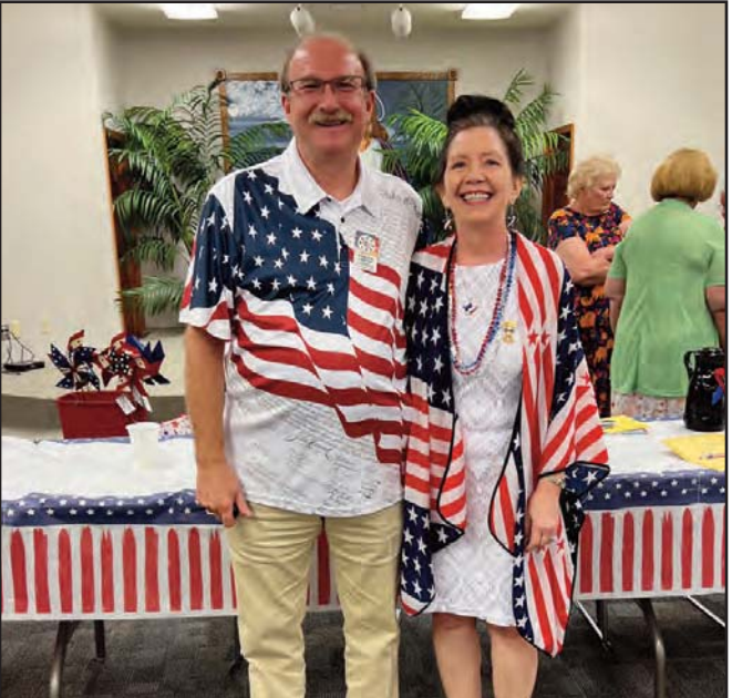
DD#6 & Husband at Dist. #13

Please be aware that on occasion a date and/or location will be changed and it will be too late to make the correction in the magazine. Thank you for your understanding.