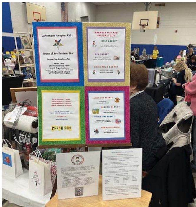
Display of projects being supported and WM's projects for the year